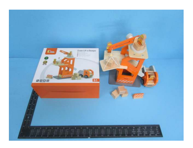
SGS authenticate the photo on original report only ***End of Report***