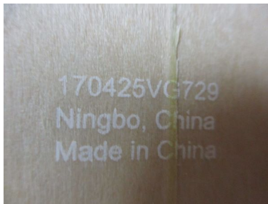
Tracking number of 50123 #1