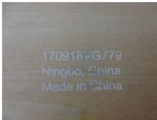
Tracking number of 50123 #2