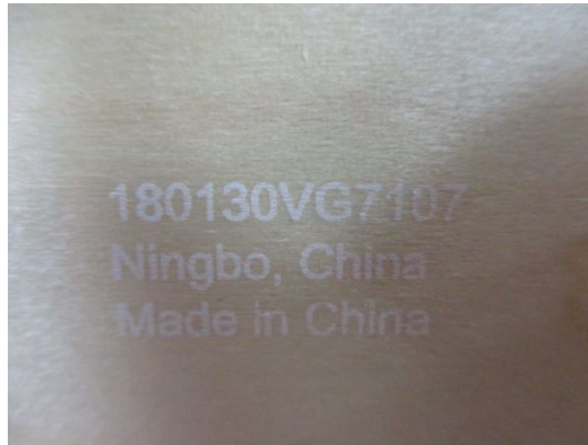
Tracking number of 50193